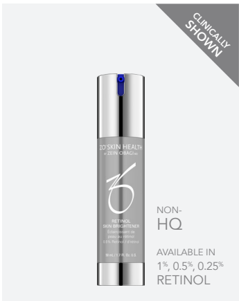
RETINOL SKIN BRIGHTENER Potent retinol brightener that's amplified with bakuchiol to accelerate the improvement of discolouration while maximising brightening without added irritation. 50 mL / 1.7 Fl. Oz.

For patients who want an effective hyperpigmentation solution without hydroquinone, the ZO® Non-Hydroquinone Brightening Portfolio is the optimal choice. These brightening solutions rapidly brighten and even skin tone, minimise the appearance of redness, improve skin colour and reverse the signs of ageing.