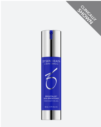
BRIGHTALIVE® SKIN BRIGHTENER This non-retinol skin brightener increases luminosity, visibly improves skin clarity and fades the appearance of dark spots. 50 mL / 1.7 Fl. Oz.

A core objective for ZO® is to use the best and most effective ingredients available – with the goal of delivering the best results. Precise, targeted and multi-modal Brightalive® technology enables fast onset of skin brightening and skin tone evening without irritation or skin sensitivity.